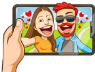
A Parent's Guide to Sharing Pictures