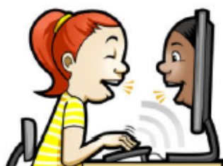
A Parent's Guide to Social Media