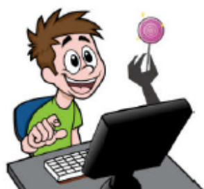
A Parent's Guide to Online Grooming